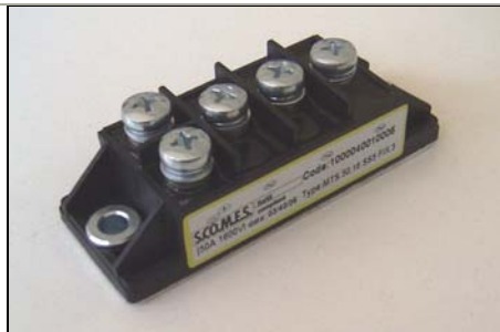
MTS 50.16 SS FIX5